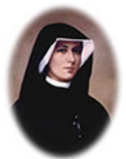
Saint Maria Faustina

God loves us and He wants us to recognize that His mercy is greater than our sins, so that we will call upon Him with trust, receive His mercy, and let it flow through us to others.